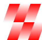
ZEPSR Association of Electrotechnical Industry of the Slovak Republic