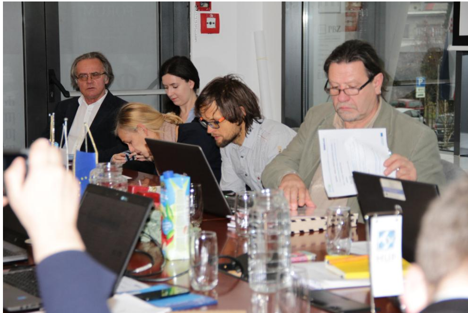
A representative of CPI Slovenia presented ongoing activities of Work package 3 – Designing of curriculums.

The presentations gave rise to a detailed discussion about the selected skill gap areas. It was agreed that the fields of presented skill gaps are quite wide, which is why it was necessary to narrow the fields by choosing one skill which will be most suitable for all participants. All partners agreed on the chosen skills and set a framework for further development of the curricula.